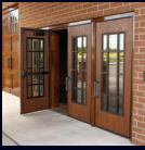
DOORS & FRAMES