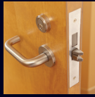
HARDWARE & KEYING