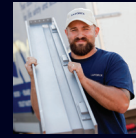
PRE-INSTALL & INSTALL